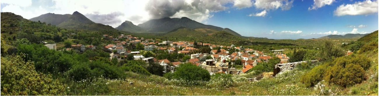
Hızırşah Village, Datça

Summer School for Architecture and Design Related Disciplines