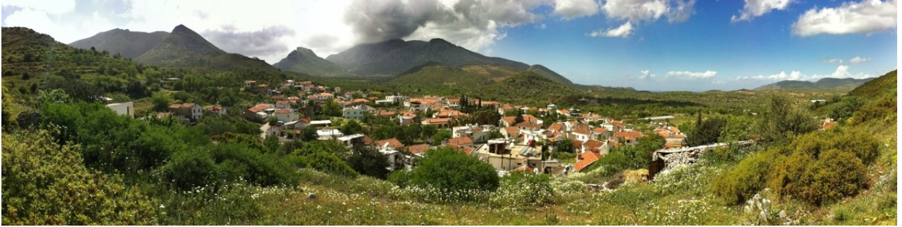
Hızırşah Village, Datça

Summer School for Architecture and Design Related Disciplines